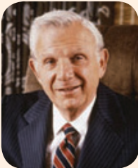
Henry Bloch , Cofounder and Honorary Chairman, H&R Block