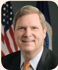
Tom Vilsack, U.S. Secretary of Agriculture

10:30 a.m. Closing Plenary Defining Philanthropy’s Role in Society Colonial Ballroom